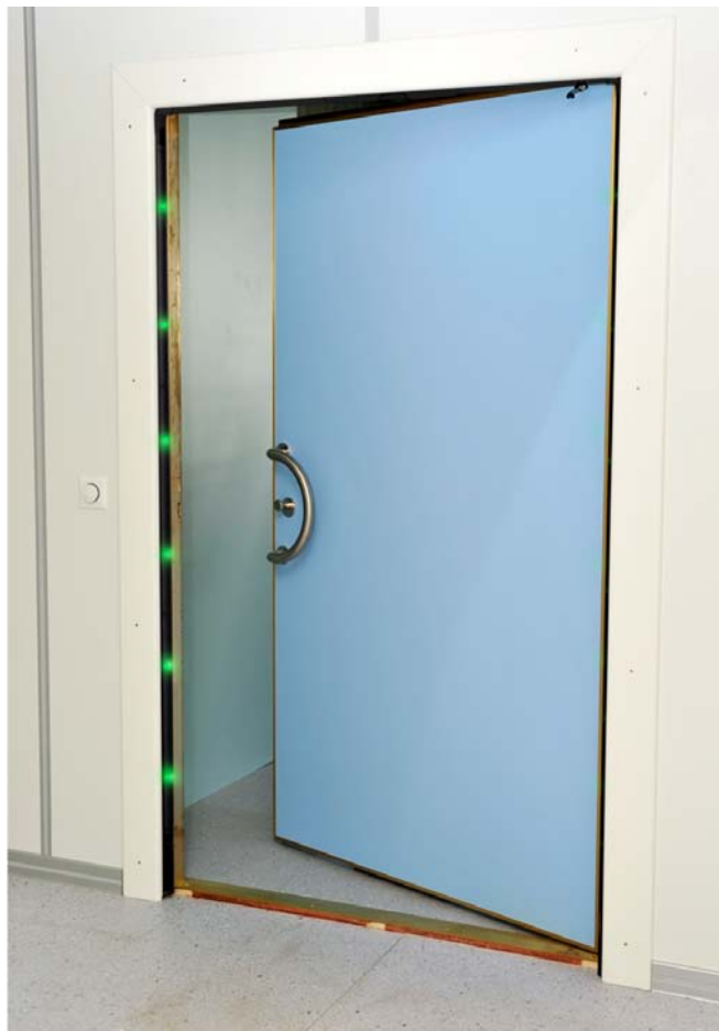
FerrAlert™ HALO II - Built-In configuration.

Photoelectric Sensors: Activates Audio Alarm only when portal threshold is crossed by a ferromagnetic threat, and only on objects entering the MRI room; not on exiting