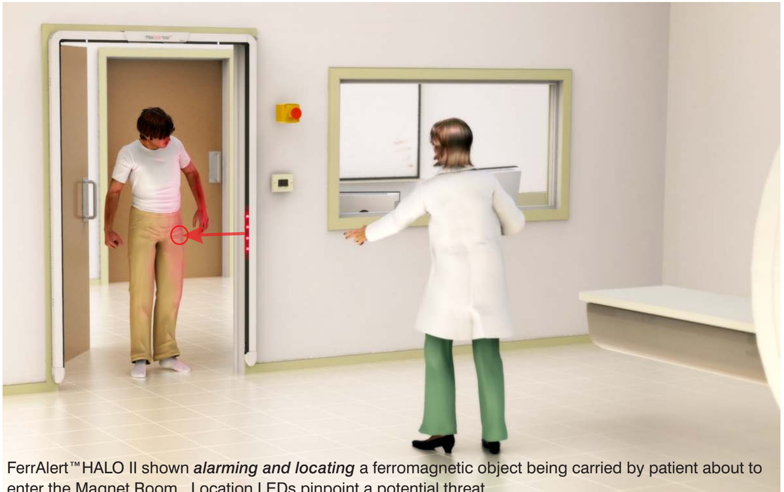
FerrAlert™ HALO II shown alarming and locating a ferromagnetic object being carried by patient about to enter the Magnet Room. Location LEDs pinpoint a potential threat.

Unlike other detectors, ONLY FerrAlert™ allows the Technologist to have full control of the MRI room when working inside and can quickly pinpoint the location of the ferromagnetic threat.