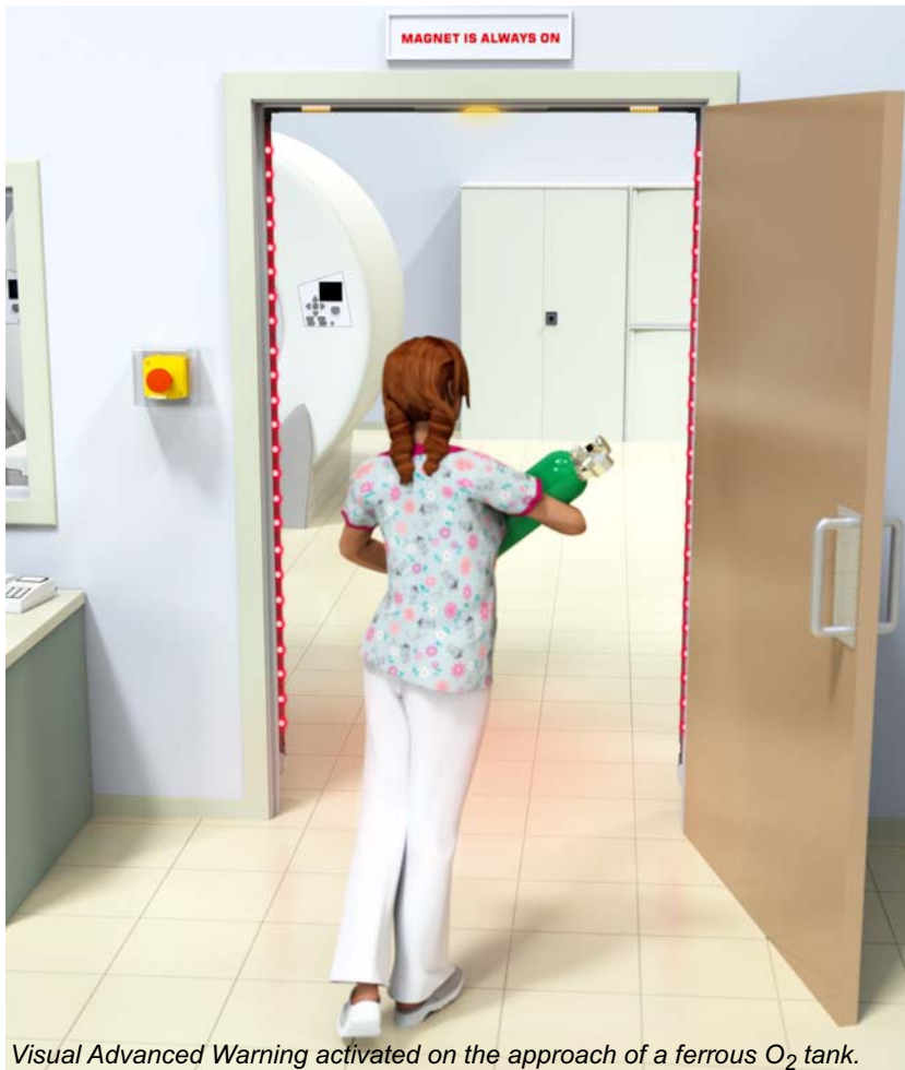
Visual Advanced Warning activated on the approach of a ferrous O 2 tank.

The New Plus Package dramatically reduces alarm fatigue by not alarming on the MRI door and ferromagnetic objects exiting the MRI room. In addition, FerrAlert™ HALO II Plus accepts our new accessory Ferromagnetic Incident Log Manager (F.I.L.M.) , which assists with Root Cause Analysis and facilitates compliance to the new Joint Commission standard.