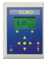
ALMO-1 one-channel system, 1 detector connectable

The ALMO-system is available in three versions: