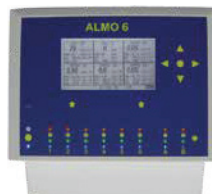
ALMO-6 multi-channel system, up to 6 detectors connectable