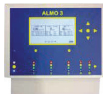
ALMO-3 multi-channel system, up to 3 detectors connectable